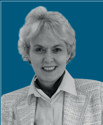
Baroness McIntosh of Pickering, Inquiry Co-Chair

As this report makes clear, the government needs to go further and faster in that work and in setting up the mechanisms to turn ambition and frameworks into reality. For our part, we propose to continue this conversation across the sectors, and to drill down into specific aspects in follow-up work on this complex and difficult issue of how to achieve housing growth and successfully address water management challenges.