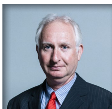
Daniel Zeichner MP