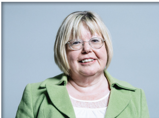
Liz Twist MP